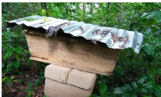
COLONIZED BEE HIVE