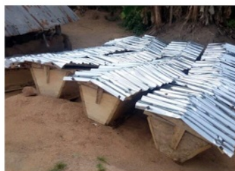
BEE HIVES READY FOR DISTRIBUTION