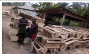
CONSTRUCTION OF BEE HIVES