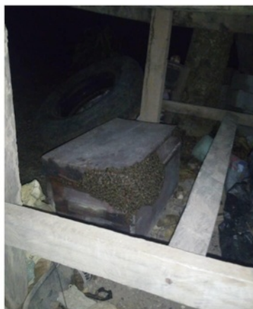
COLONIZED BEE HIVE