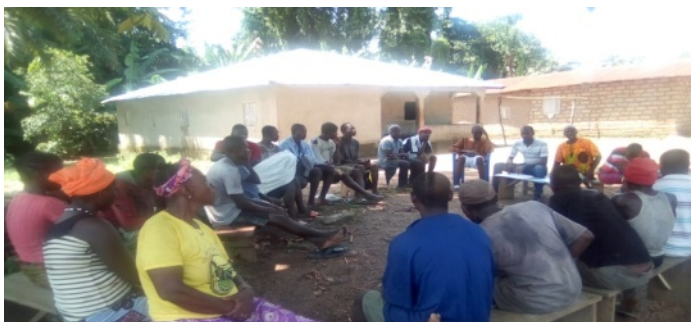
Stakeholders on project planning meeting