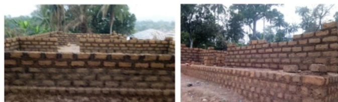
CONSTRUCTION OF HONEY PROCESSING CENTER