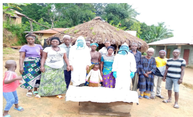
GOLDEN DROP INVESTMENT MEMBERSHIP ON TRAINING