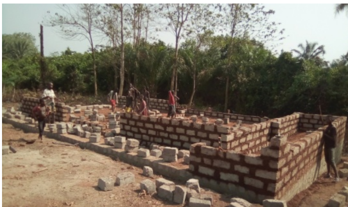
Partitioning of the school foundation