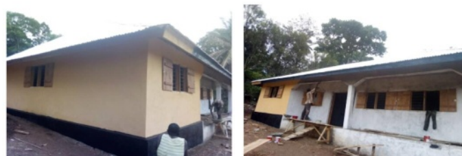
COMPLITION OF HONEY PROCESSING CENTER AT BORBU