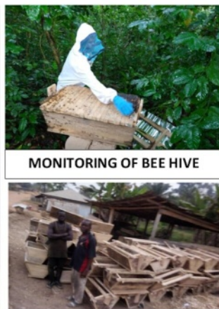
MONITORING OF BEE HIVE