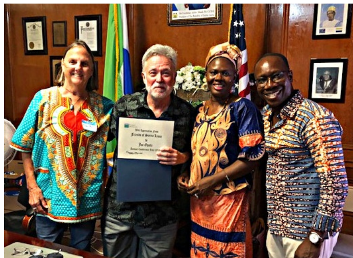
More images from the 2019 Friends of Sierra Leone Annual Meeting at the Sierra Leone Embassy in Washington DC